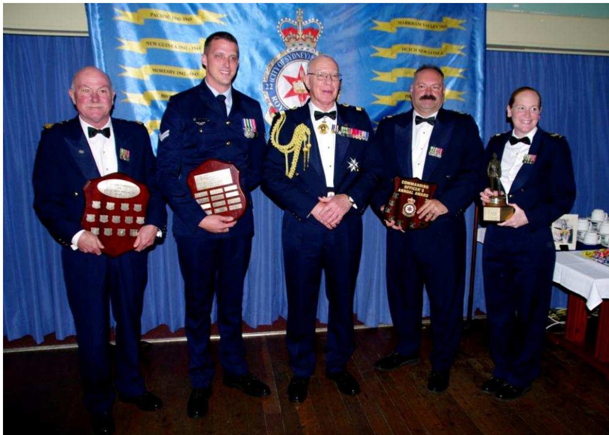
Winners of the 2017 awards at this year's Newton VC dinner

Patron : His Excellency General The Honourable David Hurley AC DSC (Ret'd) Governor of New South Wales